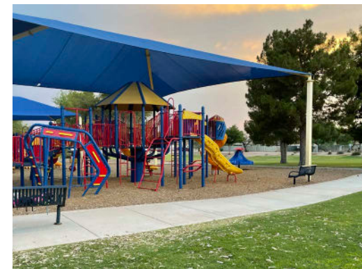
Our neighborhood playground