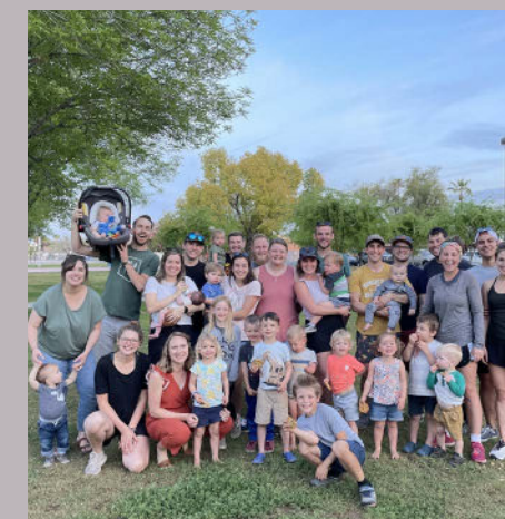
Church friends park day