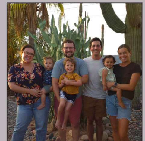
Hanging with neighborhood friends