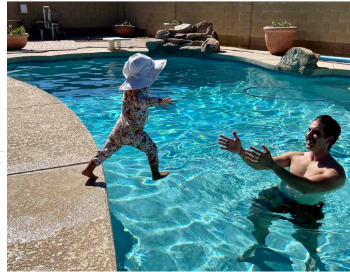
Swimming at grandma's