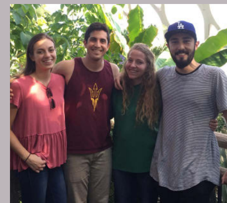
Botanical garden with friends

Our community of friends is so important to us. We have so much fun together having game nights, movie nights, camping and going on adventures. Many of our friends are from our church, and they have been a tremendous source of love, strength, and wisdom as we build our life and family together.