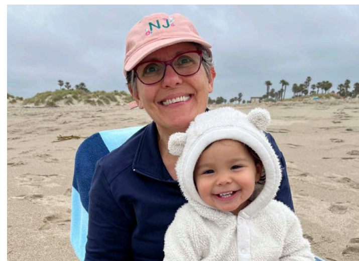
Beach days with Grandma