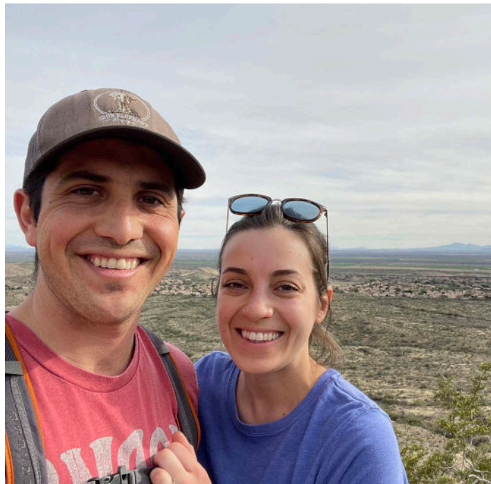
Lots of hiking nearby