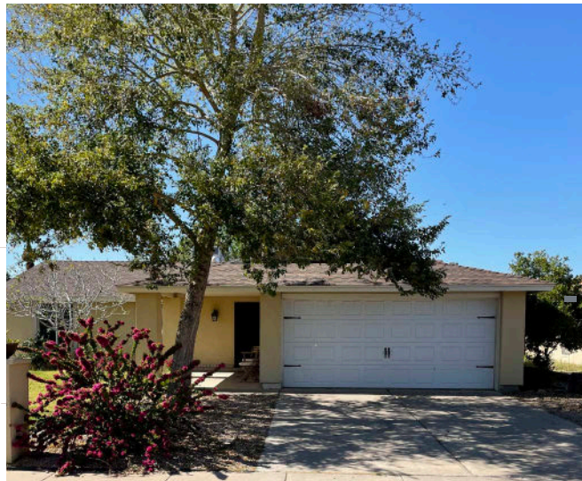
We love our home