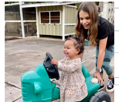
Older cousins are fun!