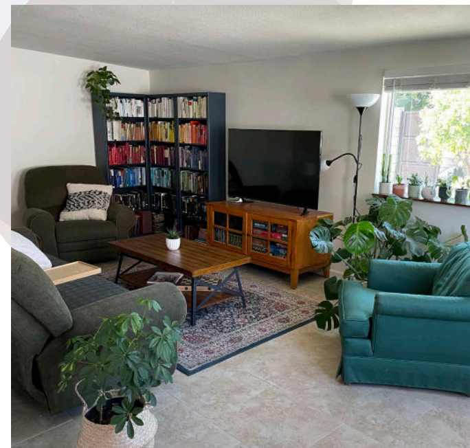
Our favorite room